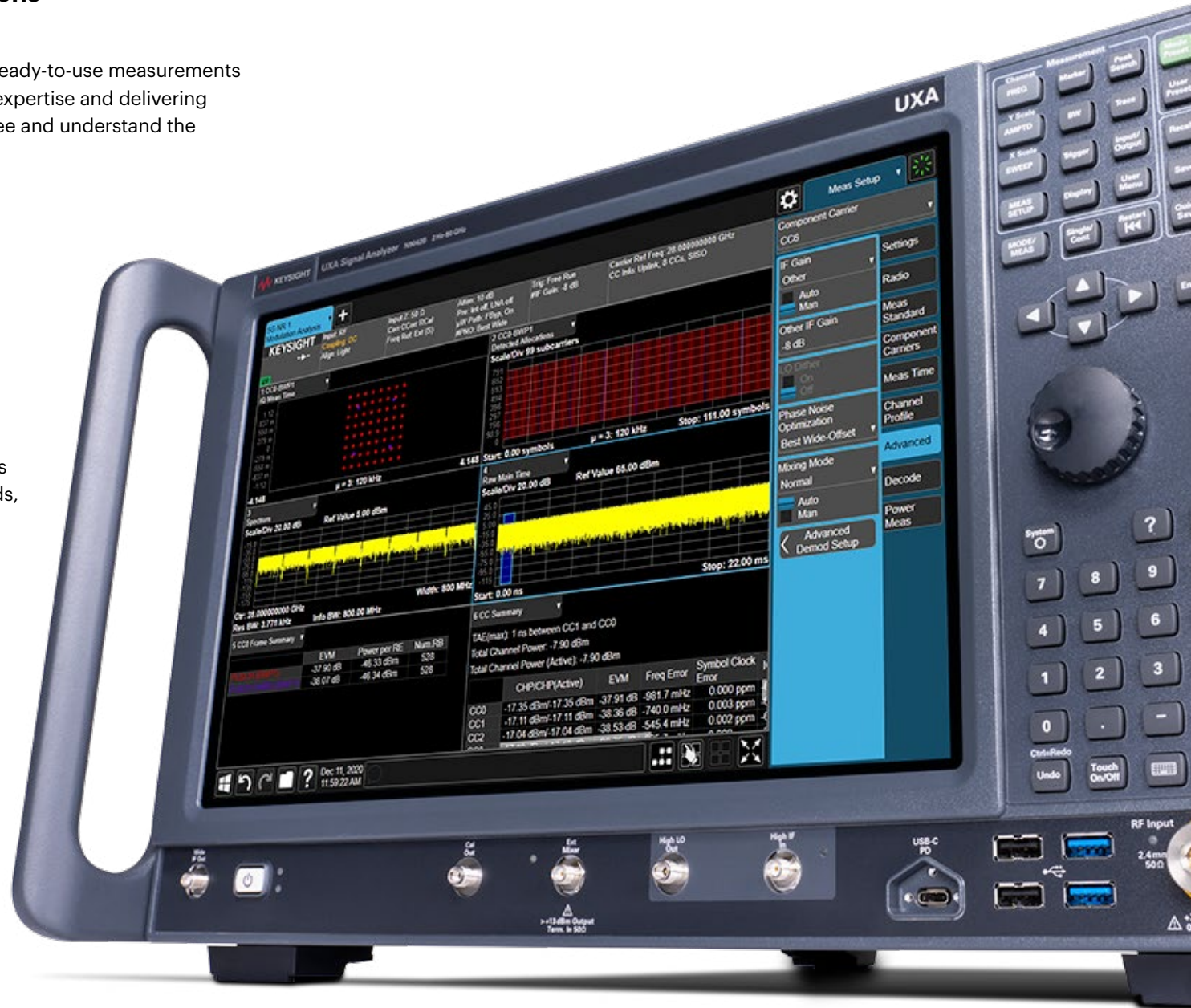
N9042B UX Series Signal Analyzer

Keep your software current with the latest enhancements and measurement standards. Receive priority access to application experts familiar with the software, the latest standards, and techniques that provide insights into measurement challenges and emerging technologies.