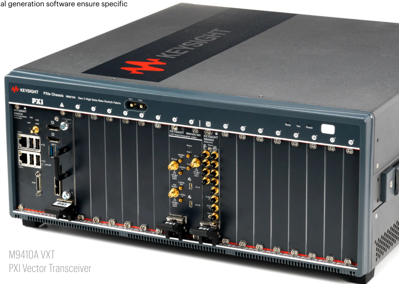
M9410A VXT PXI Vector Transceiver