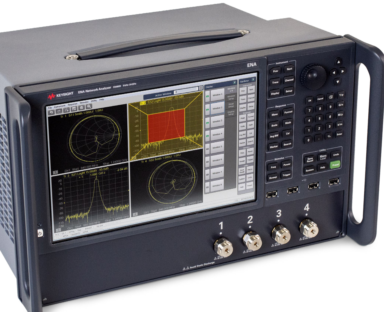
E5080B ENA Vector Network Analyzer