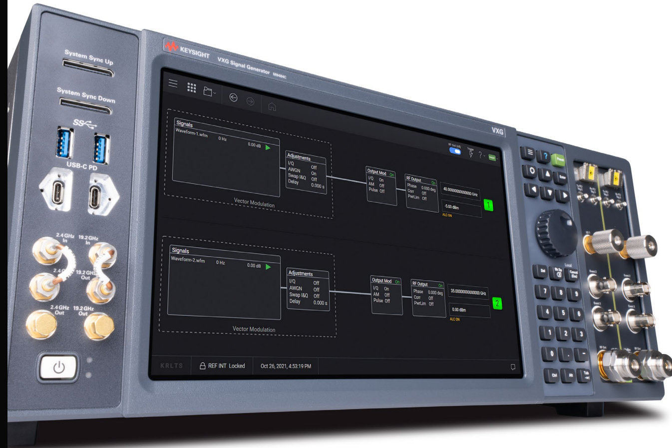
M9484C Microwave Vector Signal Generator