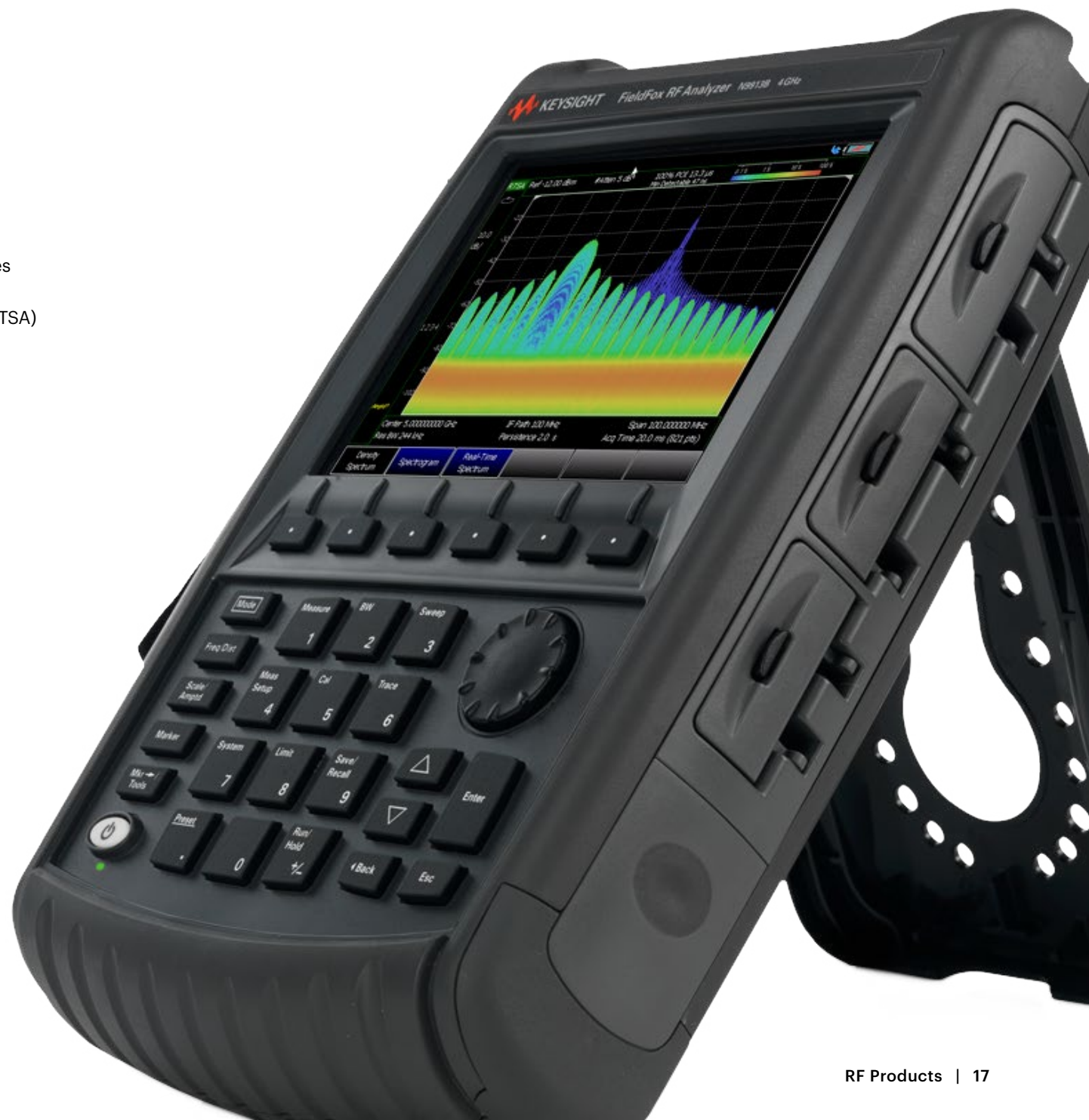
N9913B FieldFox Handheld Microwave Analyzer

Interference is everywhere — and traditional analysis is not reliable. This white paper discusses interference sources, the flaws of traditional analysis, and how real-time spectrum analysis (RTSA) improves interference detection.